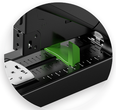
Adjustable depth guide keeps your clinches in the right spot with every stack.