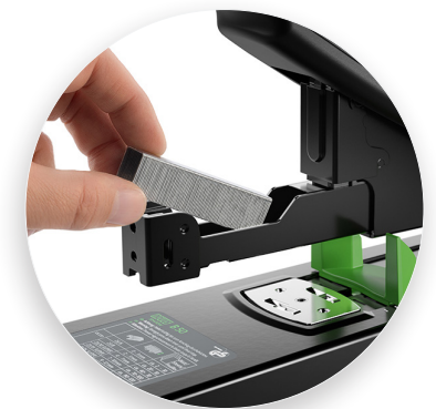
Anti-Blocking System prevents jams and the hassle of stuck documents.