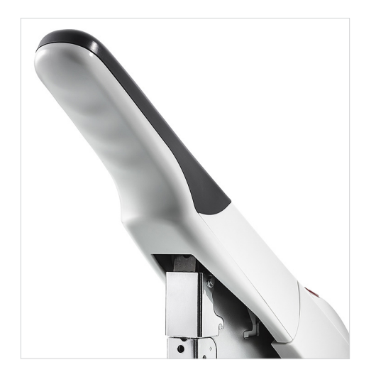
The long handle features 2-points of leverage for more power with less effort.