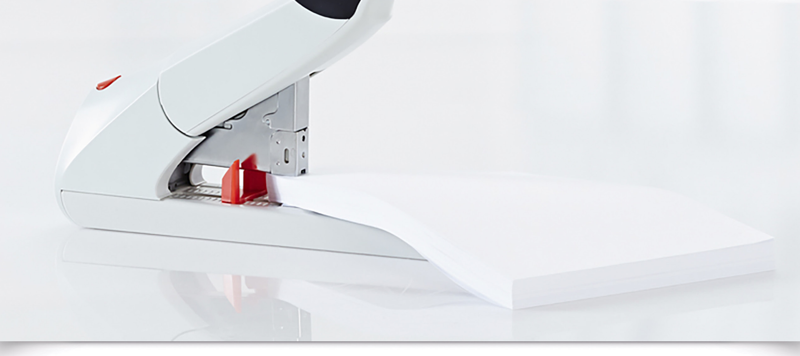
Built for long-lasting durability, Novus Heavy Duty Staplers are designed to easily staple large stacks of documents with minimal effort.