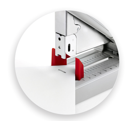
Anti-Blocking System prevents jams and the hassle of stuck documents.