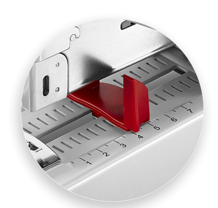
Adjustable depth guide keeps your clinches in the right spot with every stack.