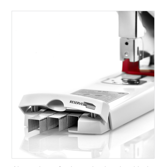
Always have fresh staples handy with the built-in staple storage compartment.