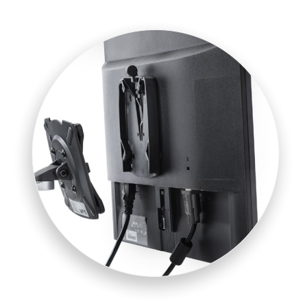
QuickRelease connection makes it easy to relocate or upgrade monitors.