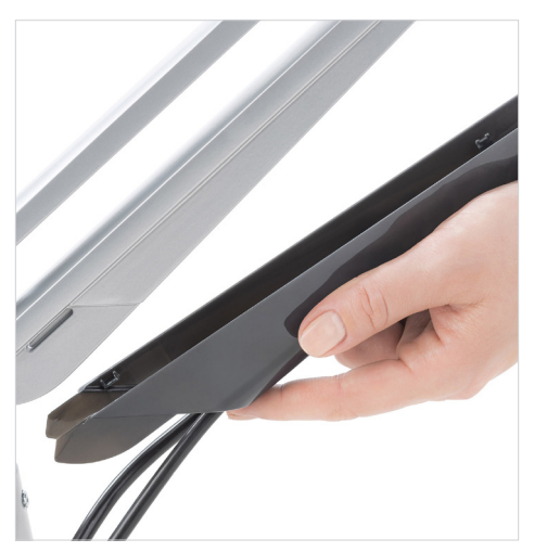
Space-saving design allows you to neatly hide cables to maximize your workspace.