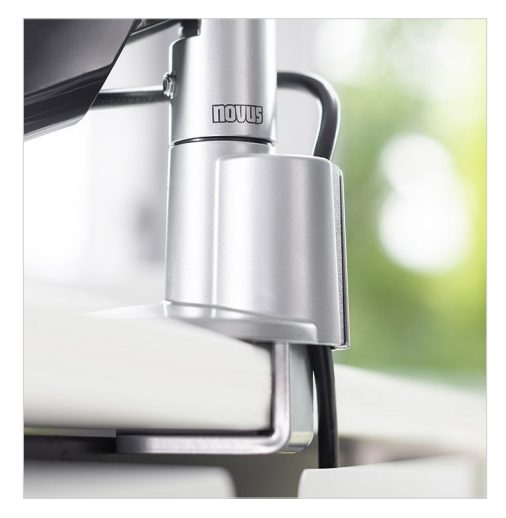
Fast installation on any work surface gets you up and running quickly.