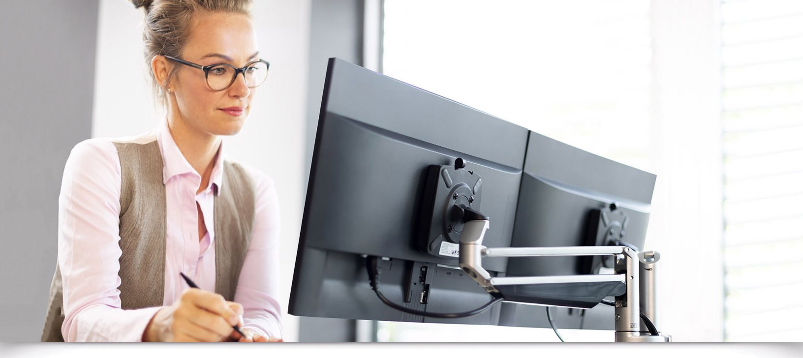
The Novus CLU Duo is designed for easy alignment of two monitors for comfortable side-by-side viewing.