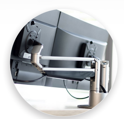
Easily align dual monitors with gas spring movement.