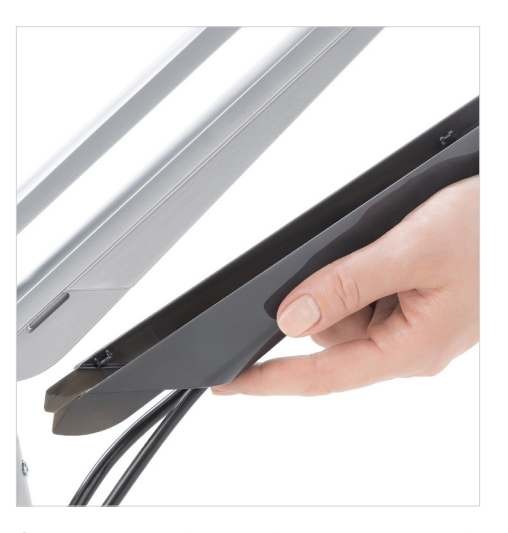
Space-saving design allows you to neatly hide cables to maximize your workspace.