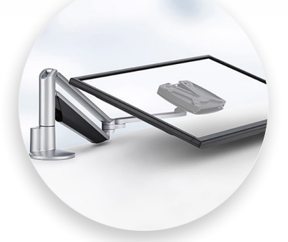
Flexible positioning for low screen viewing.