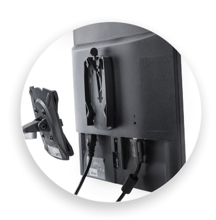
QuickRelease connection makes it easy to relocate or upgrade monitors.