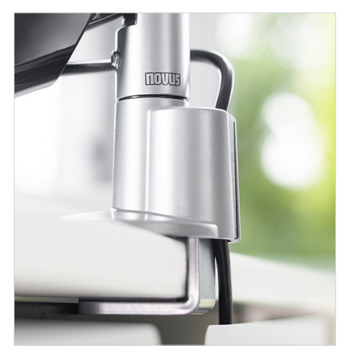
Fast installation on any work surface gets you up and running quickly.