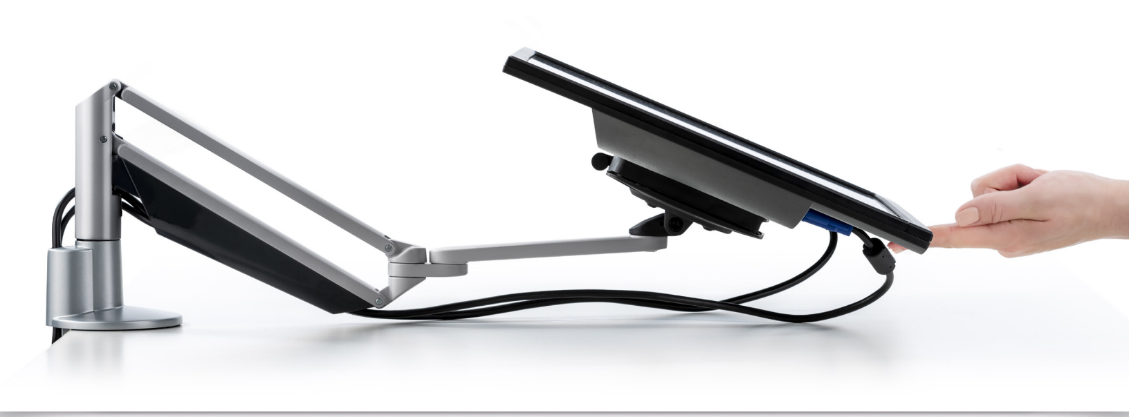
The Novus CLU III is designed to easily move into a very low viewing position that's ideal for touch screen use.