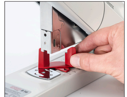
Adjustable depth guide ensures you staple at the desired depth each and every time.