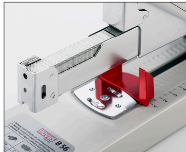
Dual staple guide system provides even pressure on the staple legs to prevent jams.