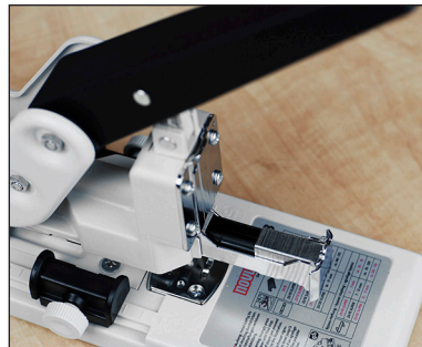
Dual staple guide system provides even pressure on the staple legs to prevent jams.