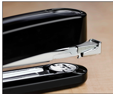
Dual staple guide system provides even pressure on the staple legs to prevent jamming.