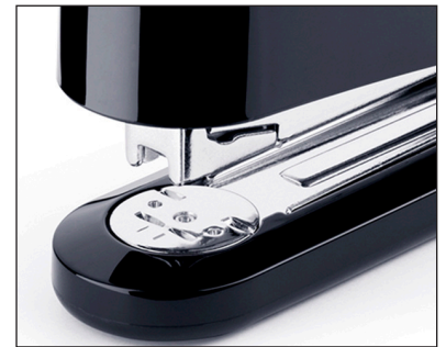
Adjustable anvil rotates for either a permanent flat clinch, temporary pin, or tack.